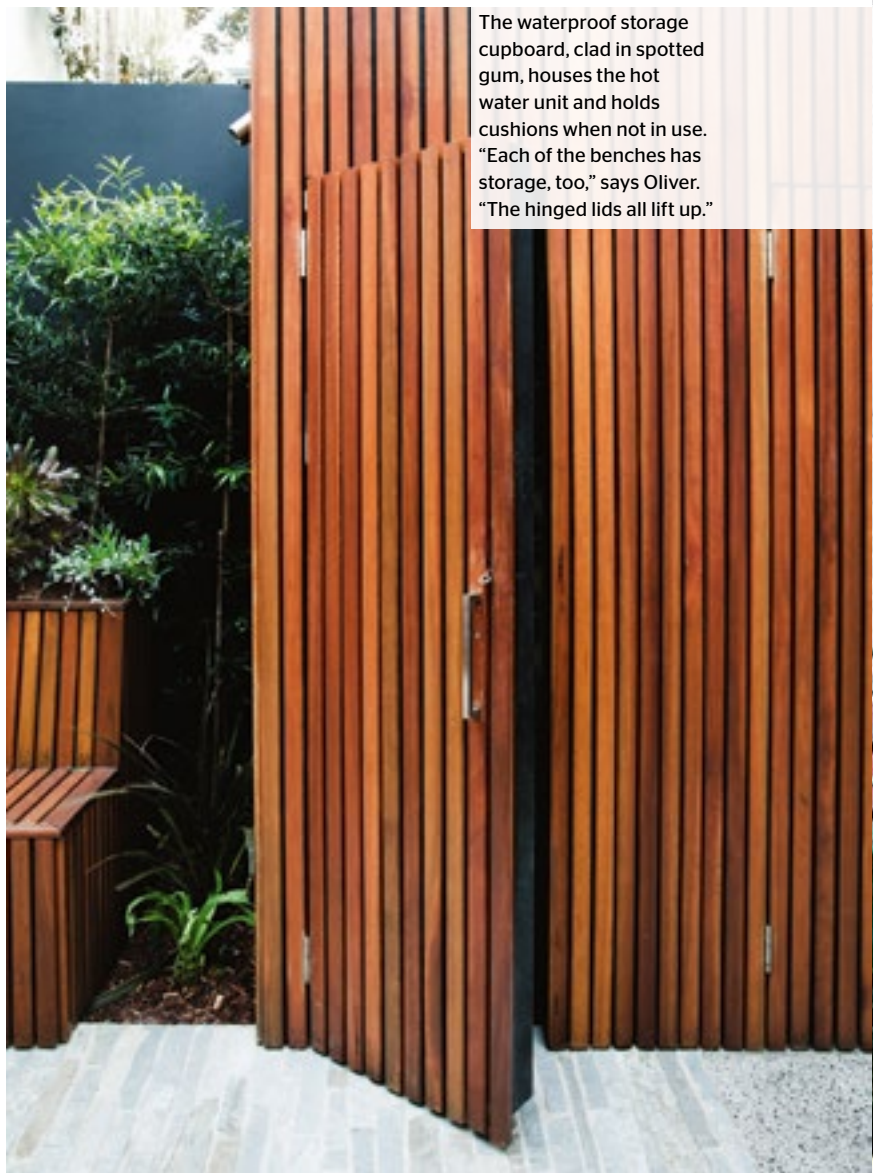
The waterproof storage cupboard, clad in spotted gum, houses the hot water unit and holds cushions when not in use. "Each of the benches has storage, too," says Oliver. "The hinged lids all lift up."