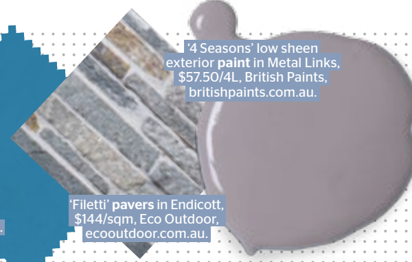
'4 Seasons' low sheen exterior paint in Metal Links, $57.50/4L, British Paints, britishpaints.com.au .