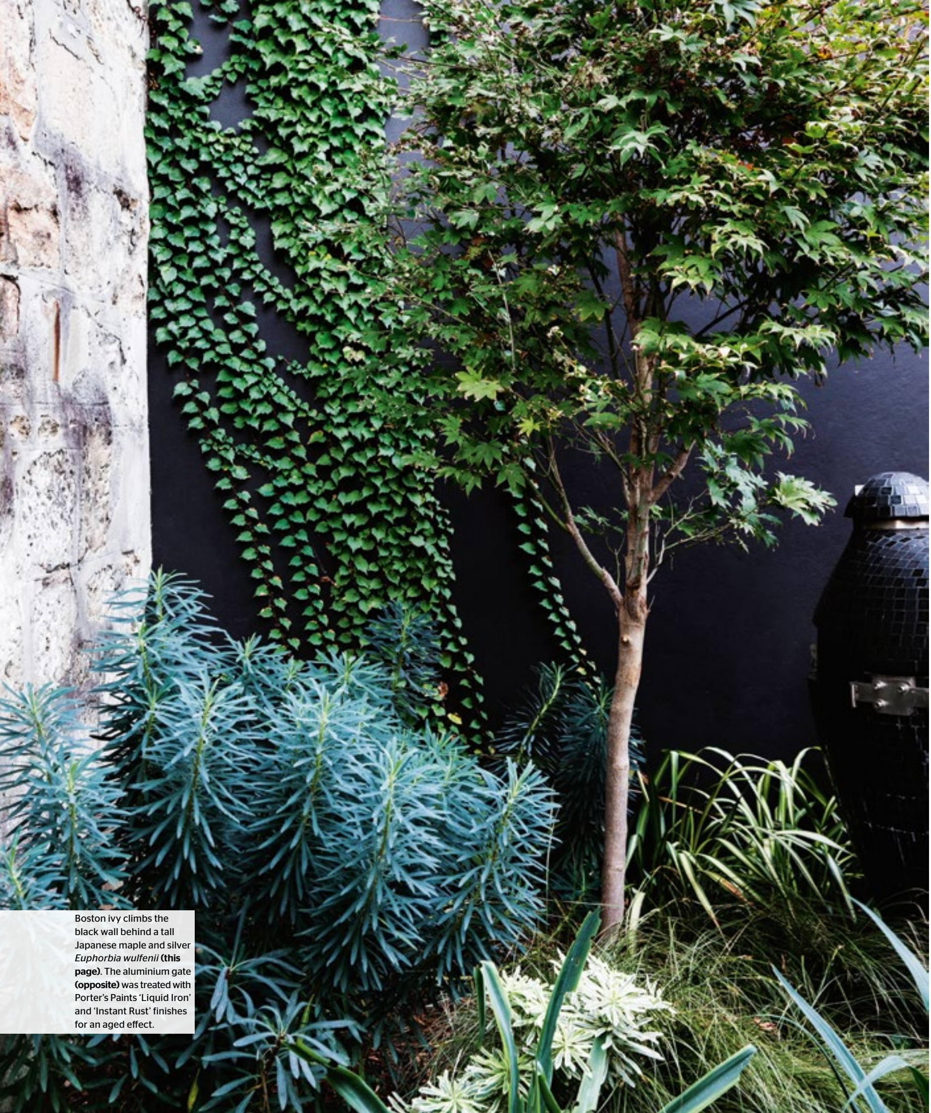
Boston ivy climbs the black wall behind a tall Japanese maple and silver Euphorbia wulfenii (this page). The aluminium gate (opposite) was treated with Porter's Paints 'Liquid Iron' and 'Instant Rust' finishes for an aged effect.