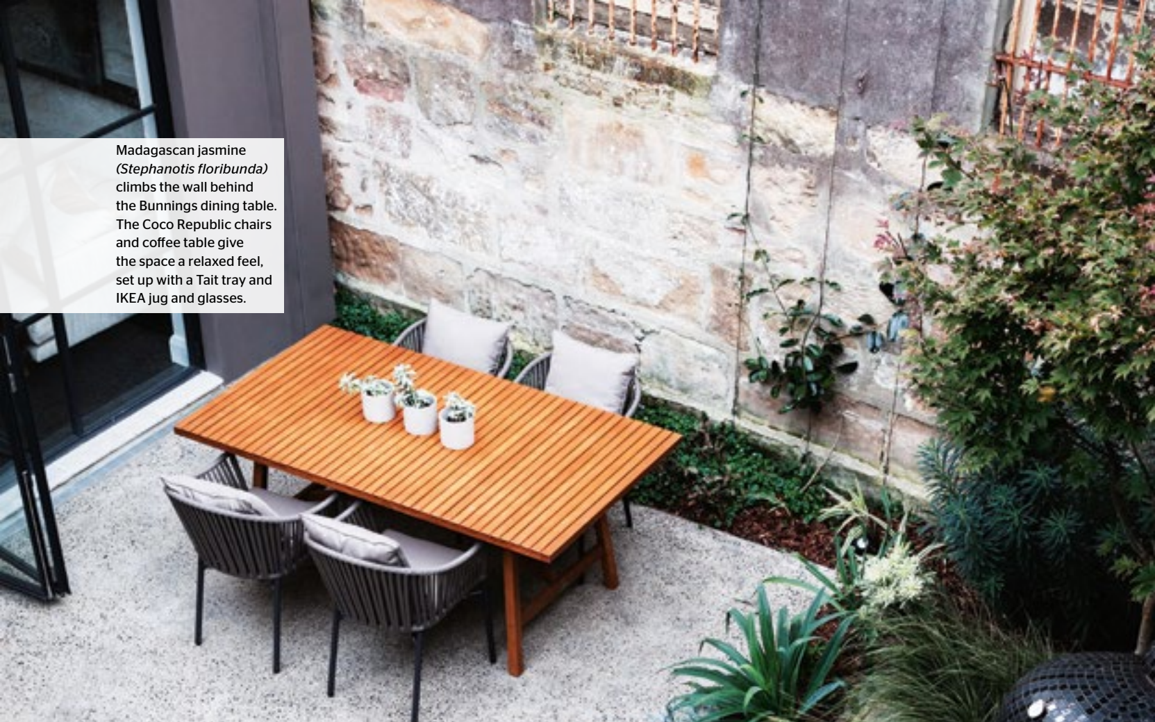
Madagascar jasmine ( Stephanotis floribunda ) climbs the wall behind the Bunnings dining table. The Coco Republic chairs and coffee table give the space a relaxed feel, set up with a Tait tray and IKEA jug and glasses.